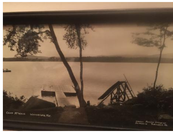
CAMP McWain for Girls in 1930's

Roebuck. The home was shipped via the Grand Trunk Railroad to South Paris, Maine from Chicago. This "new Birch Lodge" was the start of Camp McWain. The original Birch Lodge still stands on the shores of Lake McWain. The first brochures of Camp McWain advertised it as a "Camp for Delicate Girls", girls who needed to gain weight, who were pale, and who tired easily. The delicate girls got plenty of