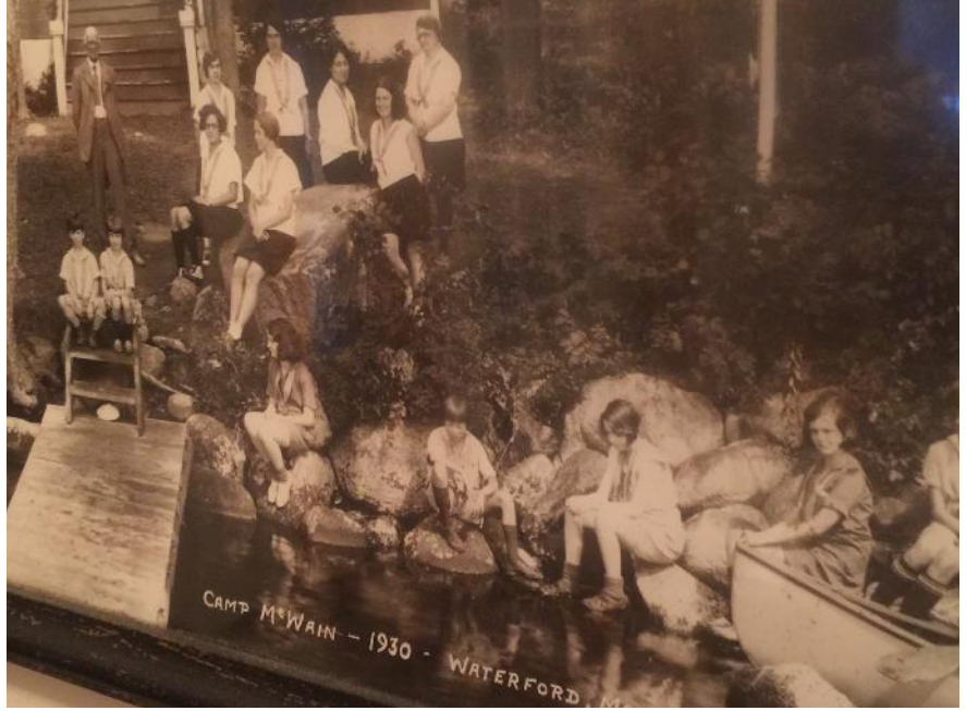
CAMP McWain for Girls in 1930's

The Whichard and Muzik families have now been in the Waterford area for over 80 years, and still loving the picturesque area, the beautiful sunsets, the clear, clean lake and the peacefulness of the tiny village of Waterford Maine!