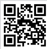
Scan with phone to join