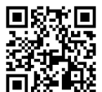
Scan with phone to register